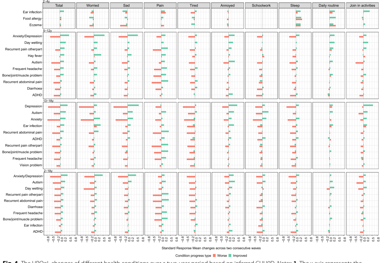
Fig. 4 The HRQoL changes of different health conditions over a two-year period based on inferred CHU9D. Notes : 1. The x axis represents the HRQoL changes measured in standard response mean (SRM). The "Improved" represents those who recovered from the condition while the "Worse" represents those who newly developed the condition. Health conditions are ranked according to the HRQoL changes of the "Improved" group. 2. Anxiety and depression were only measured separately from the 6th wave of LSAC (10–13 years old for B cohort and 14–17 years old for K cohort), and they were measured together between 4th and 7th waves (6–17 years). Thus, anxiety or depression were presented as one category in 5–12 years old age group, and as two separate categories in 13–18 years old. 3. Children aged 2–4 years old had only three conditions available with status changes given no HRQoL data was available for 0–1 year olds

score over time for 2–18 years were anxiety/depression, ADHD, autism, bone/joint/muscle problem, recurrent abdominal pain, recurrent pain in other part, frequent headache, diarrhea and day-wetting. The impacts to specific health dimensions differed by health conditions in the expected direction.