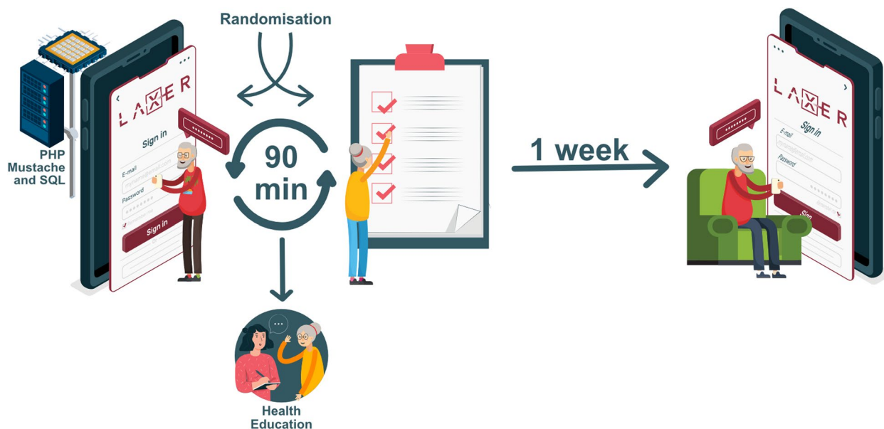
Fig. 1 Outline of crossover design of PROM versus ePROM and 1-week delay test-retest (ePROM). Abbreviations: ePROM: electronic Patient Reported Outcome Measures; PHP: hypertext preprocessor; PROM: Patient Reported Outcome Measures; SQL: structured query language

developing innovative solutions beyond standard face-to-face management to effectively monitor and address xerostomia, dysphagia and QoL in patients with HNC, driving the aim of this study.